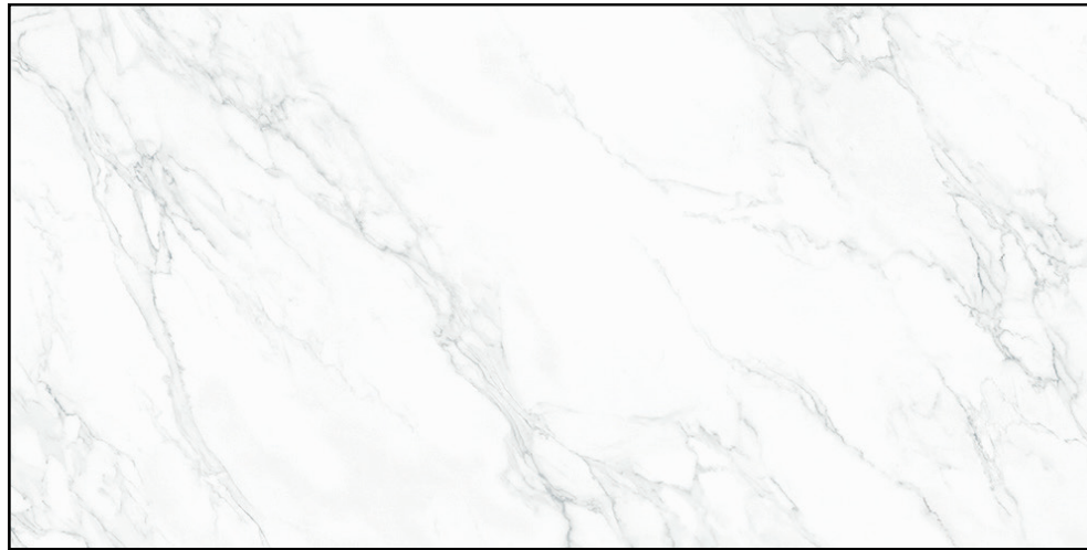
PORCELAIN SLABS - STATUARIO - 1/8" JOINTS OLYMPIA TILE + STONE