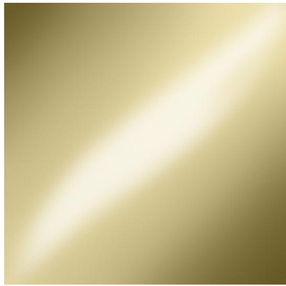
GOLD FINISH STOREFRONT FRAMING