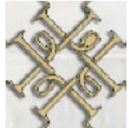
DECORATIVE METAL SCROLL GOLD FINISH