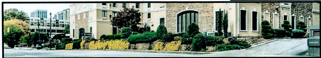
CASCADING LANDSCAPING TO BE RESTORED

PROPOSED REVISED SITE SCALE 1/8" = 1'-0"