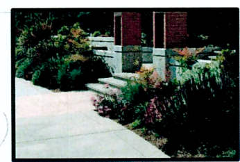
STREET LEVEL SEASONAL PLANTING