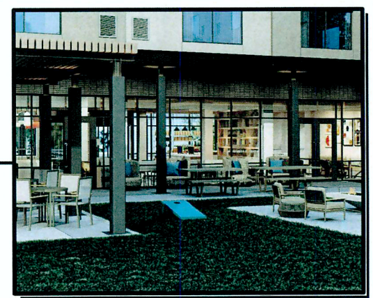
NEW WINDOW WALL & CANOPY (REMOVING PUNCHED WINDOWS)