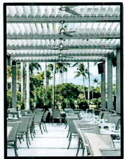
NEW TRELLIS OVER TERRACE LOUNGE