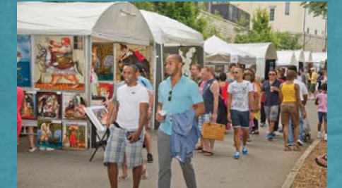
Art festival/ temporary pieces