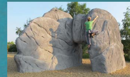
Rock/ sculpture climbing