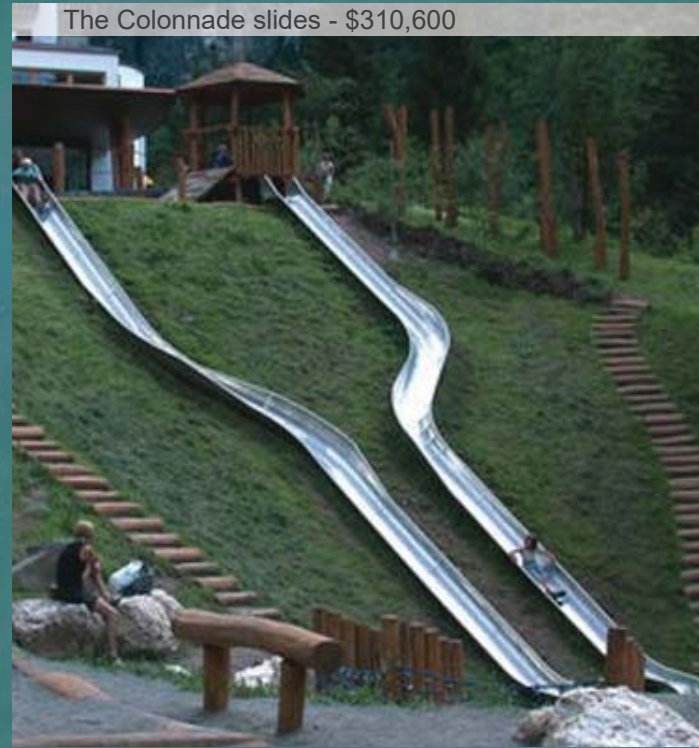
The Colonnade slides - $310,600