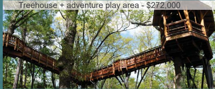
Treehouse + adventure play area - $272,000