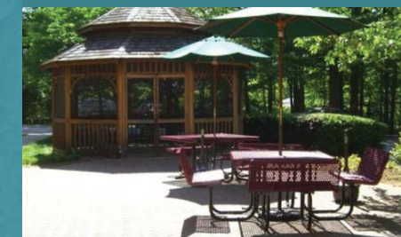
Plaza space for people to gather/ staging area with a shelter/gazebo