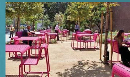
Movable tables and chairs