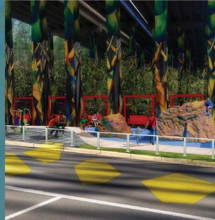
The Colonnade climbing + exercise area - $491,000