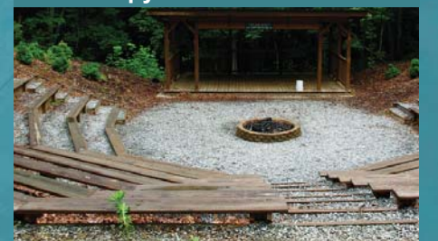
Amphitheater with a fire pit