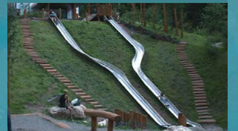
Playground with slides, swings, sail canopy