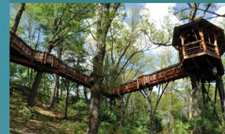
Treehouse/ adventure playground