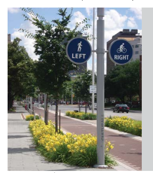
Cultural Trail | Indianapolis, Indiana