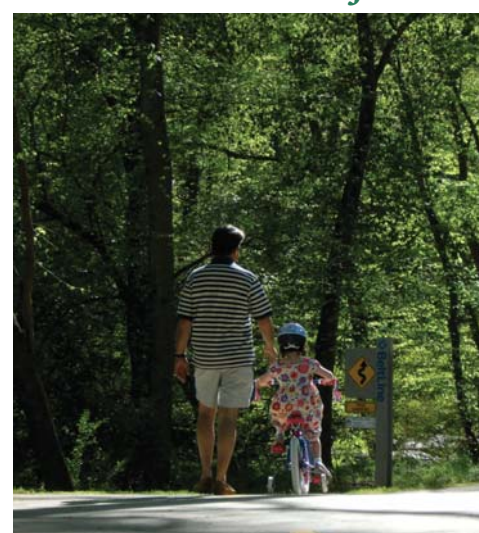
Tanyard Memorial Trail | Atlanta, GA