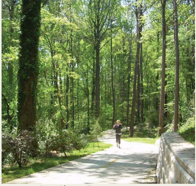
Nancy Creek Trail | DeKalb County, GA