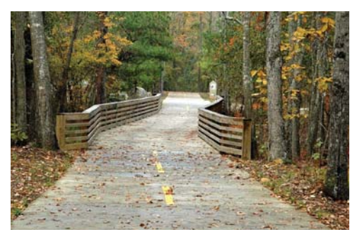
Arabia Mountain Trail | DeKalb County, GA