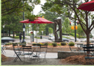
Example of a Plaza

Plazas should be located for southern exposure and be located on the exterior edges of properties adjacent to the right-of-way. They should be a minimum of 900 - 2,500 sq. ft. and include, deciduous shade trees, movable tables and chairs, fountains, public art, etc.