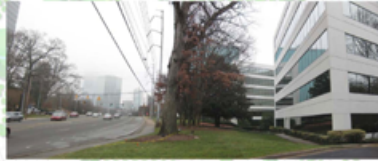
Potential Plaza Space | Before