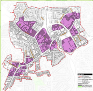
Commercial + Retail Areas with Access to a Plaza within 800'