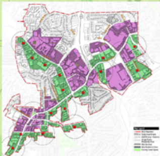
Proposed Plazas for Commercial + Retail Areas without Access to a Plaza within 800'