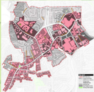
Commercial + Retail Areas