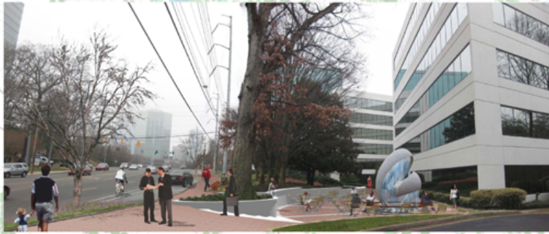
Potential Plaza Space | After